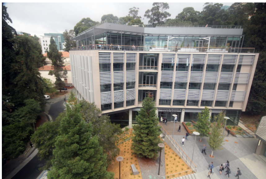
Chou Hall is the country's greenest academic building.

Connie & Kevin Chou Hall has earned the third in a trifecta of green building credentials: a WELL Certification recognizing its “strong commitment to supporting human health, well-being, and comfort.”