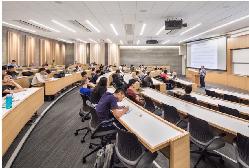
The new Chou Hall classrooms and meeting spaces were part of the Haas Master Plan Project, led by Walter Hallanan, BS 72.

Chou Hall is the core of the Haas Master Plan Project, which also included the new courtyard and the addition of cooling to Cheit Hall. The student-centered building includes classroom and meeting spaces, the state-of-the-art Spieker Forum event space, and a cafe at the courtyard level.