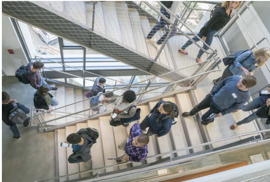
Students descending stairs in Chou Hall get exercise and a view of the trees.