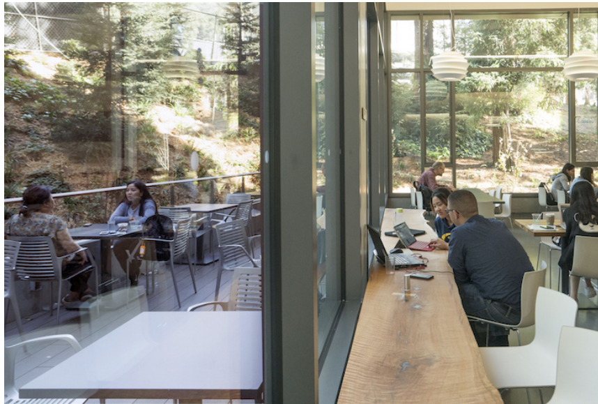
Cafe Think's seating connects the indoor cafe to the outdoors seamlessly through the use of windows.